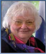
Mayor Phyllis Marcuccio

City of Rockville Elected Officials (Two-Year Term from November 2011 to November 2013)