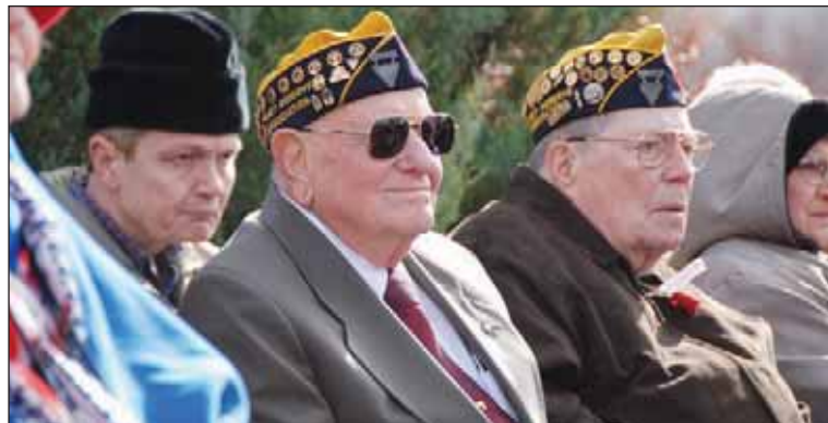
Local veterans will be honored by the community on Nov. 11.

Rockville Summit 2012 is free and open to the public. It will be from 8:30 to 11:30 a.m. on Saturday, Nov. 3, at the F. Scott Fitzgerald Theatre in the Civic Center Park, 603 Edmonston Dr. Attendees who bring cell phones may participate in text polling during the summit (those without a cell phone will have other ways to participate). ❖