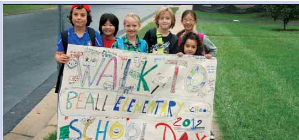
STUDENTS WALK TO SCHOOL... Almost 800 Rockville kids from five schools walked to school in October in recognition of the 15th International Walk to School Day.