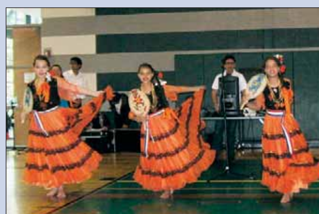
HISPANIC CULTURE ON DISPLAY... Rockville celebrated Hispanic Heritage month in October at Twinbrook Community Recreation Center with performances from central and south American dance and music groups.