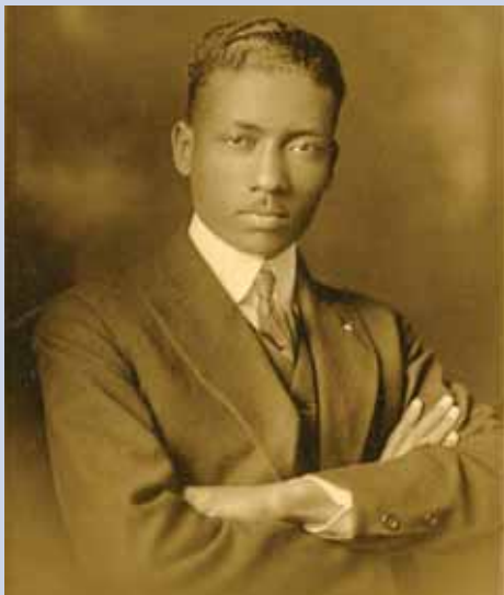
Exhibit at Rockville Memorial Library Showcases Community's History

During February the Rockville Memorial Library, 21 Maryland Ave., will showcase an historic exhibit "Lorenzo Dow Turner: Lincoln Park to Leading Scholar."