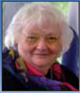
Mayor Phyllis Marcuccio

City of Rockville Elected Officials (Two-Year Term from November 2011 to November 2013)