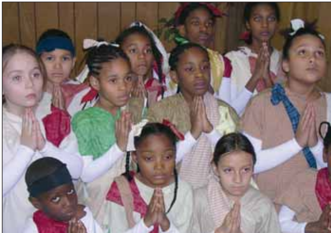
The Finest! Performance Troupe will perform this month.

Watch the City of Rockville's MLK birthday celebration at www.youtube.com/cityofrockville