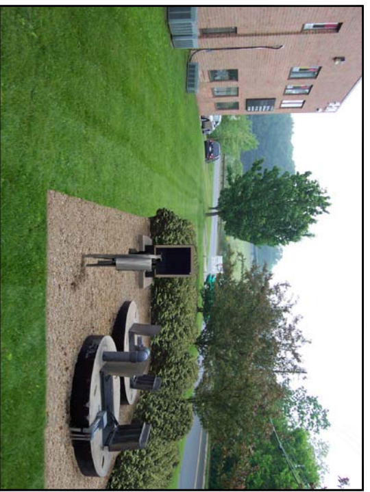
ARTIST'S RENDERING OF PROPOSED SEWAGE PUMPING STATION ALTERNATIVE 2