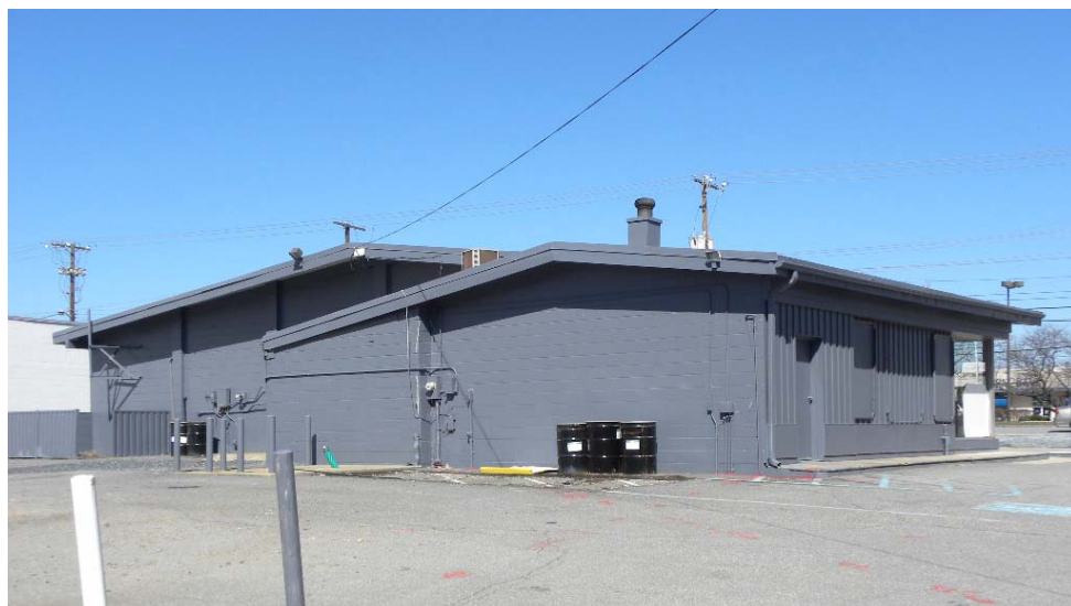
View from southwest