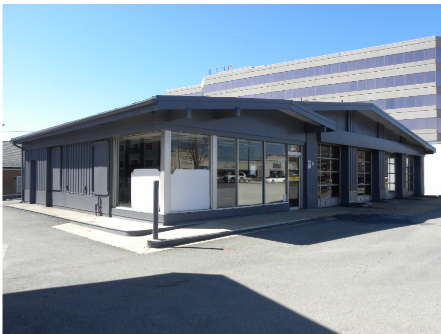
View from northeast