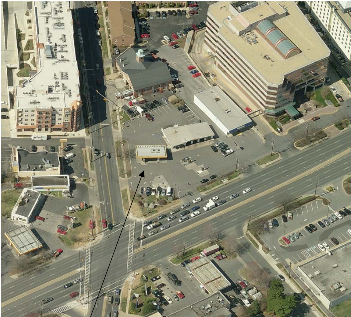
1807 Rockville Pike