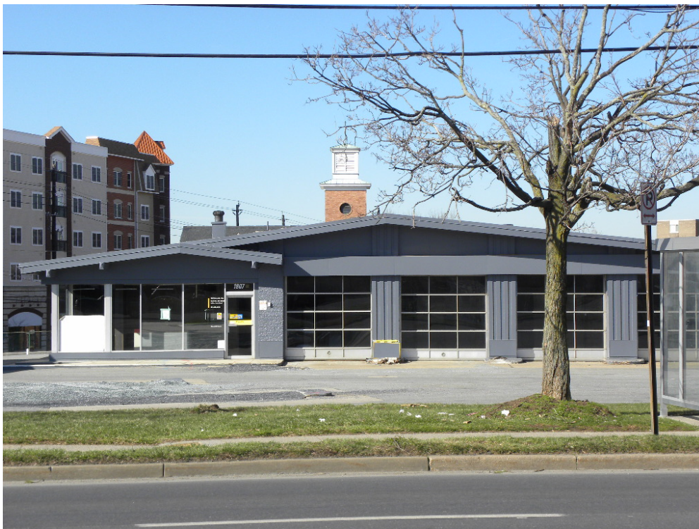
East elevation. Visible behind the station is the tower of the Rockville Volunteer Fire Department.

This one-story service station is constructed of concrete block and clad on the east (front) and north elevations with a brick veneer and vertical panels on the south elevation. The station has two intersecting, low-pitched, front gable roofs. The larger roof on the east side of the building covers the service block consisting of four bays. The roof on the west side of the building covers a smaller block that contains retail space and restrooms. Prominent features of the roofs include a deep overhang, boxed eaves, and exposed beams. The retail block projects beyond the service block on the south elevation. Four large board-on-board panels that resemble pilasters visually separate the service bays on the façade and there is also a paneled strip at the base of the wall on the north, south and east elevations.