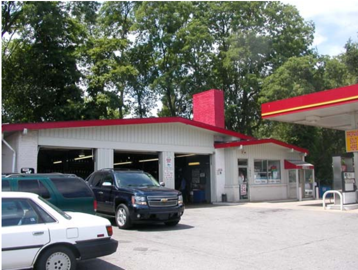
Former Shell station at 1907 Rockville Pike (Photo: Rosemary Prola, 30 June 2010).

Twinbrook neighborhood was remodeled in the new ranch style. 18 The station still stands, although it is now part of the Getty chain. The Veirs Mill Road station is very similar to the subject property, and includes a key feature of the ranch style missing from the Rockville Pike station: the “chimney stack” sign.