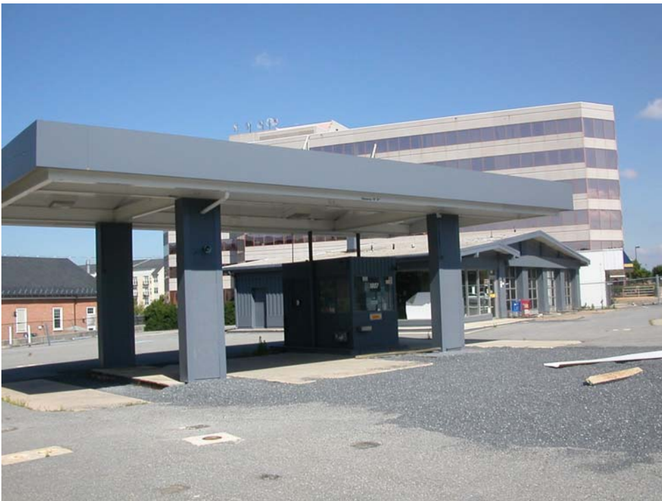
View of canopy from northeast

Southwest of the station building is a large, flat-roofed canopy supported by large piers of concrete block. Under the canopy is a cashier kiosk and space for four gasoline pumps that have already been removed. Additional gasoline pumps once stood on concrete pads on the east side of the building near Rockville Pike and a storage shed was located at the southwest corner of the building. 1 Both pumps and shed are gone.