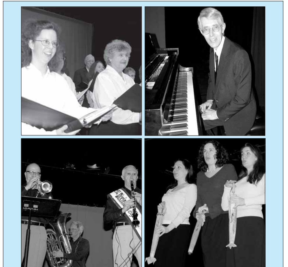
A SAMPLING OF ROCKVILLE'S ARTS... (clockwise from top left) The Rockville Chorus, its piano accompanist, the Rockville Concert Band's 'Dixieland Express' and the Victorian Lyric Opera Company were among of the groups that delighted audiences at the annual Rockville Arts Sampler held at the F. Scott Fitzgerald Theatre in March. The annual spring event is a favorite of many citizens.