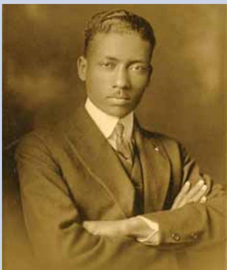
Exhibit at Rockville Memorial Library Showcases Community's History