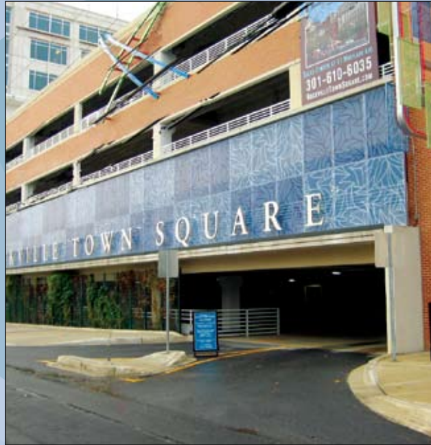
The garage is accessible from Route 355 (above) or Maryland Avenue.

A. Call 240-314-8728 or email parking@rockvillemd.gov