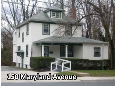
150 Maryland Avenue