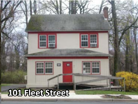
101 Fleet Street