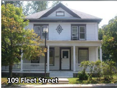
109 Fleet Street

The Rockville Heights Historic District is located at the northern end of the Rockville Heights subdivision, platted in 1890. The high-style Georgian house at 107 Fleet Street was