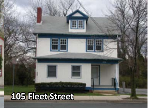
105 Fleet Street