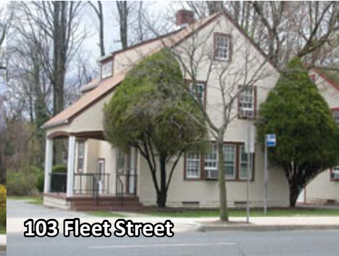
103 Fleet Street